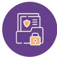
Discretion you can trust