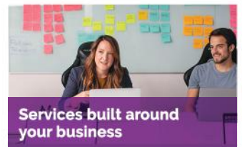
Services built around your business