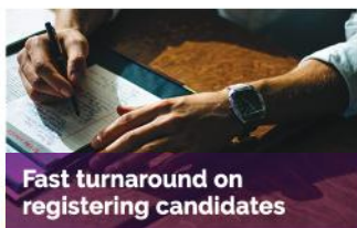
Fast turnaround on registering candidates