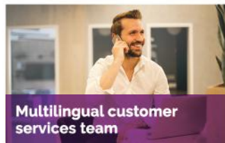
Multilingual customer services team