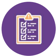
Managing & Assessing Risk