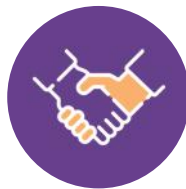
Expert consulting for your individual needs