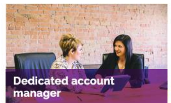
Dedicated account manager