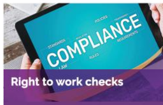
Right to work checks