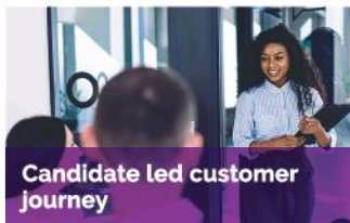
Candidate led customer journey